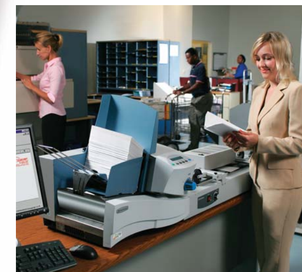
DA75S Envelope Printer shown with optional power stacker and dryer