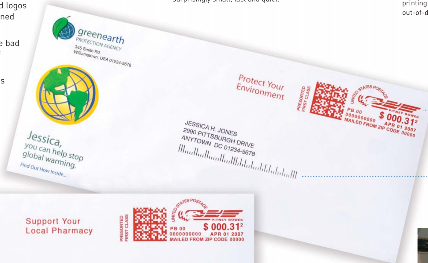
Sample meter impression from DM™ Series Digital Mailing System.