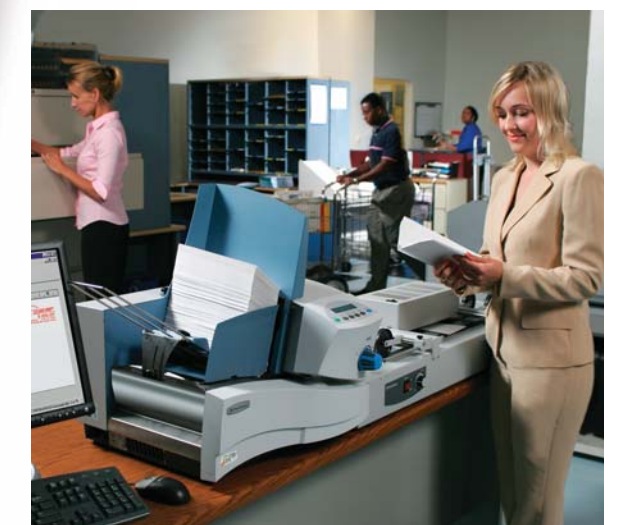
DA75S Envelope Printer shown with optional power stacker and dryer